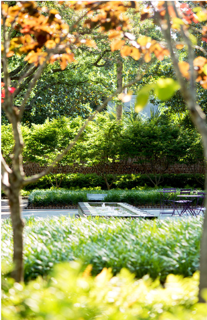
“A beautifully tranquil public garden.” - The New York Times

“A model for the future.” - The Post and Courier